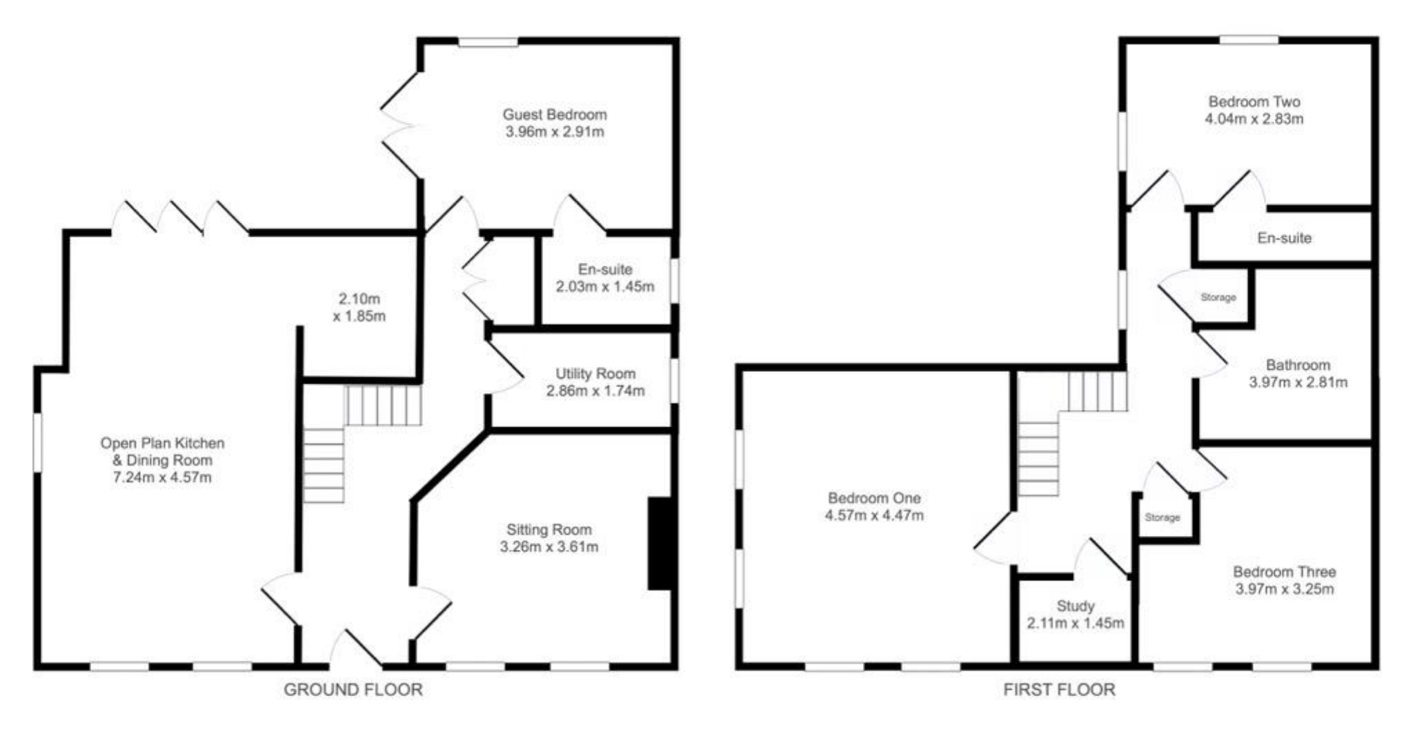
OVERALL FLOOR AREA approx 171 square metres 1840 square feet